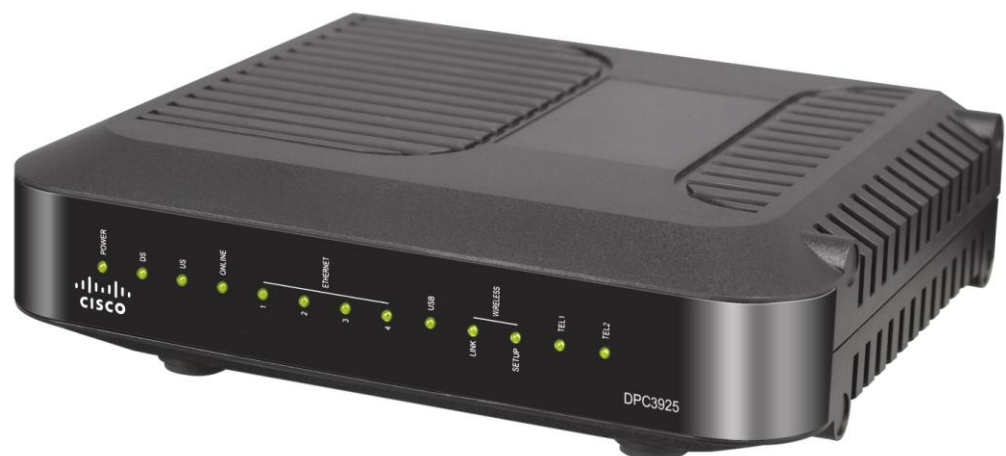
Figure 1. Cisco Model DPC3925 8x4 DOCSIS 3.0 Wireless Residential Gateway with Embedded Digital Voice Adapter (image may vary from actual product and specification)

Designed for the active digital home or office, the DPC3925 integrated router features a Dynamic Host Configuration Protocol (DHCP) server, Network Address and Port Translation (NAT/NAPT) and a Stateful Packet Inspection (SPI) firewall. These features allow the user to share a single high-speed public Internet connection as well as share files and folders between devices within the home network by attaching multiple wired and wireless devices in the user's home or office to the wireless residential gateway.